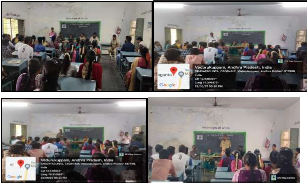
Fig: Staff & students addressing the gathering on drug abuse prevention progra

clippings of Drug Abuse prevention program in GDC, Vedurukuppam