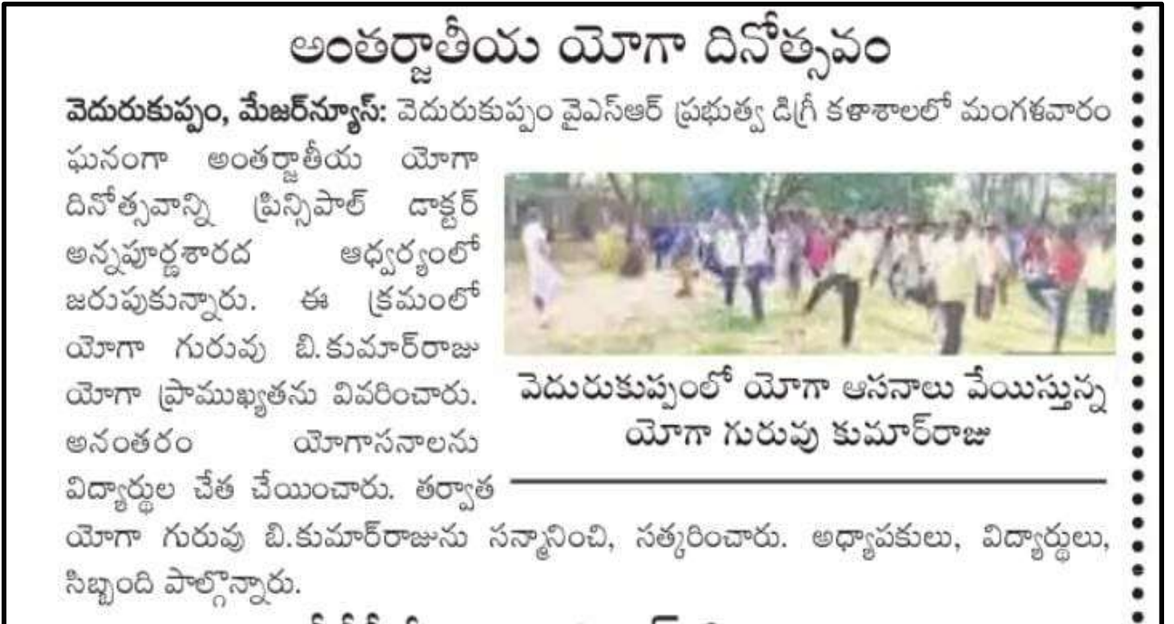
Fig: Newspaper clipping on Yoga celebrations in Dr YSR GDC, Vedurukuppam