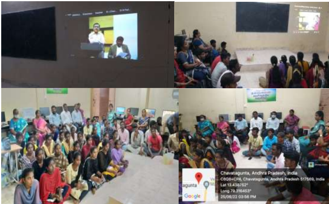
Fig: Staff and Students participation in the CCE program on 25th, June-2022 in the Dept. of computer applications around 55 students and staff participated in the program.