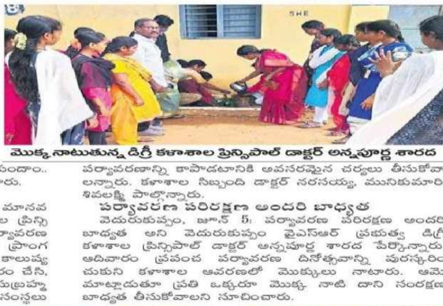
Fig: Newspaper clipping showing plantation by the principal of the college