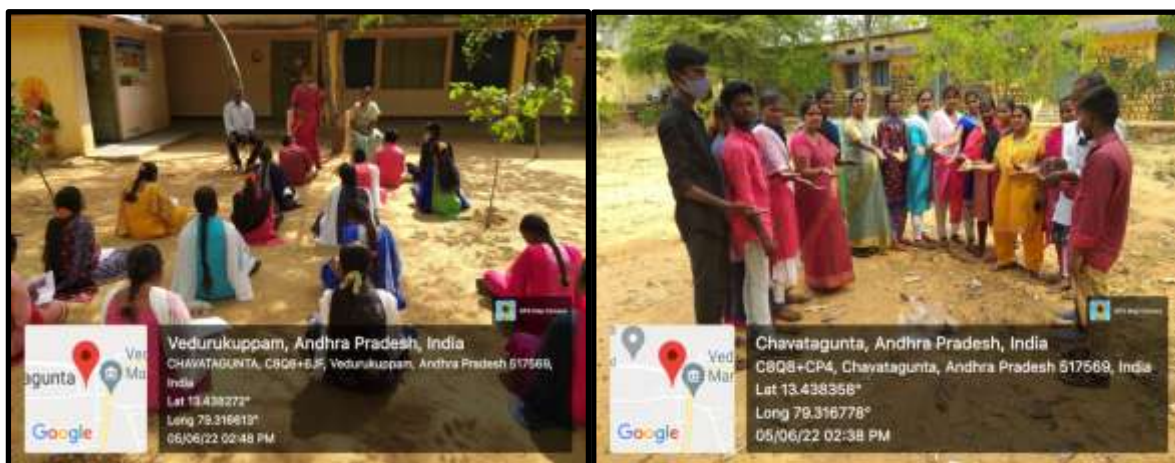
Fig: Speech on Environment day by Principal. Fig: Seed collection for plantation by students.

The following is a glimpse, showing them pictures of the environmental awareness program, Seed collection, Campus cleaning and selfies with samplings of the students and college staff as well.