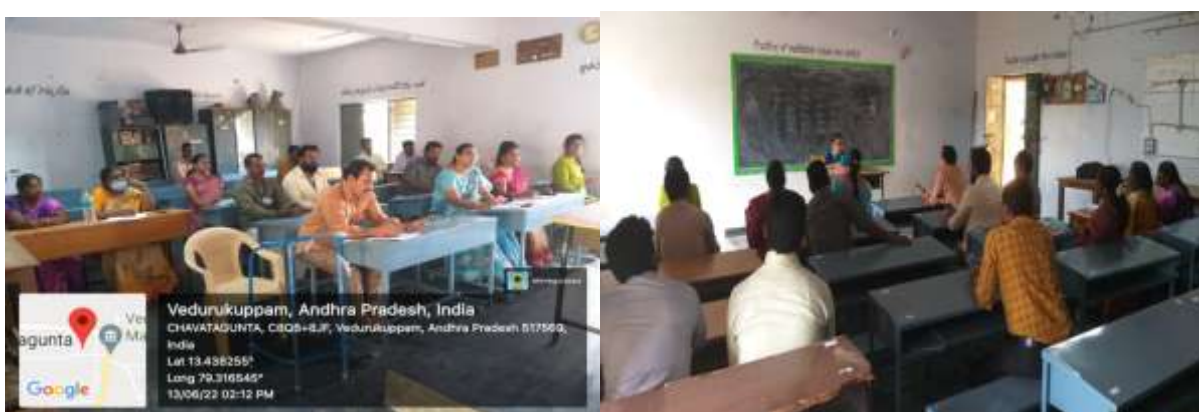
Fig.: Principal's general staff meeting conducted and discussed about II and IV Semesters time table, work load, LSC, SDC and CSP details on 13 th June, 2022.