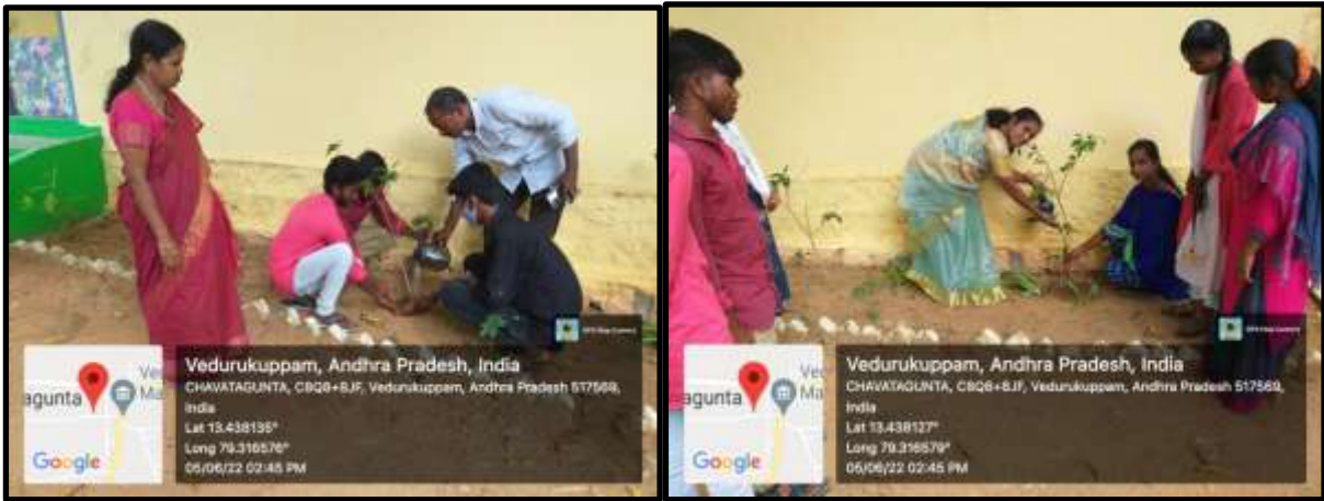
Fig: Plantation by the Principal and IQAC & DRC coordinators with the help of students.