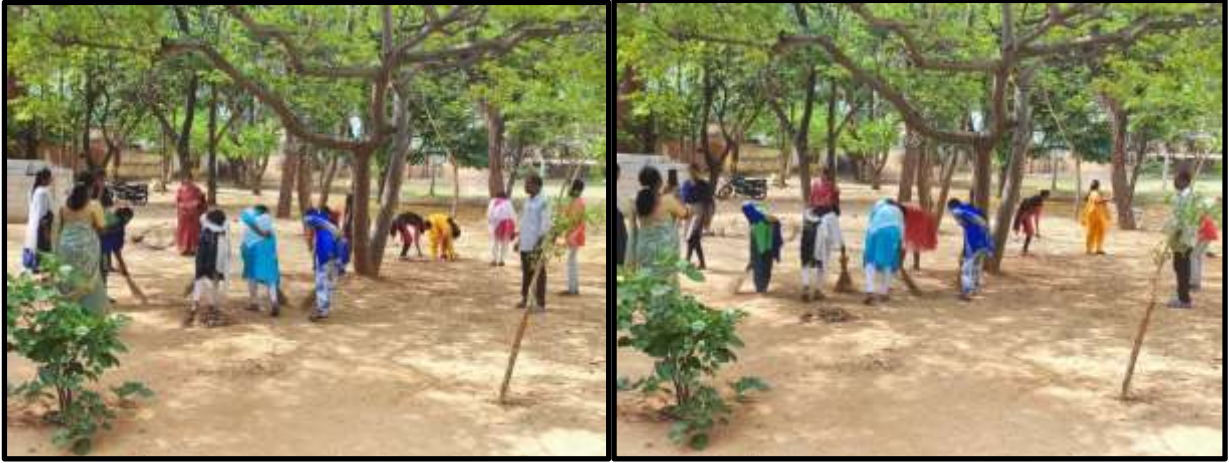
Fig: Campus cleaning by students monitoring by the principal, IQAC and DRC coordinators.