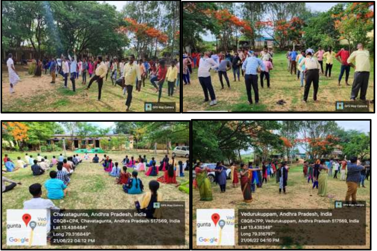
Fig: Faculty and Student's participation in the Yoga Day-2022