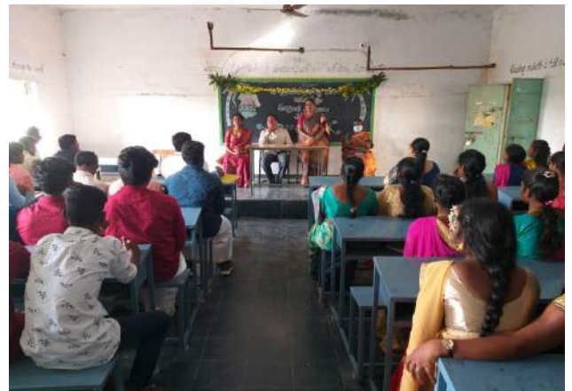
Fig. The College Principal Addressing Students

Sankranthi Sambaralu is an elaborate and colourful three-day celebration held in India to mark the beginning of a new year. For Hindus, it marks the start of their New Year and is considered to be one of the most important festivals. It's celebrated with a lot of zeal and enthusiasm, and people exchange mutual greetings and wishes with each other.