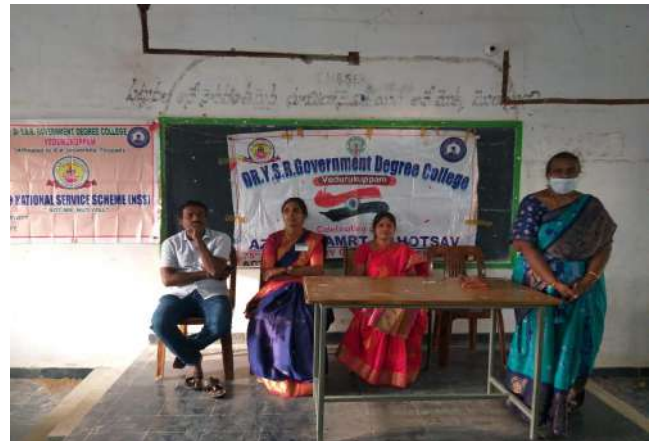
Fig. Glimpse of the National youth Day Program. YRC and NSS together conducted the program under the umbrella of IQAC of Dr. YSR Government Degree College, Vedurukuppam.