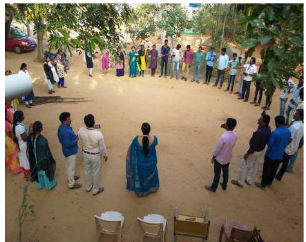
Fig: Slogans about Drug Abuse Awareness

The program is also uploaded on Youtube with a link of ---- https://youtu.be/3kz-imvK5eA- . Throughout the program, all the students & staff cooperated in making the programme a grand success. The following are a few glimpses of the program.