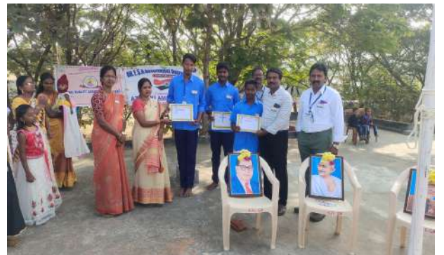
Fig: Glimpses of the Republic Day Celebrations