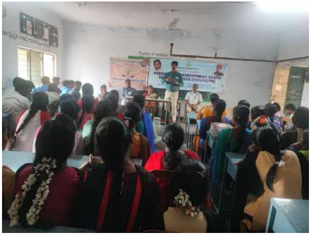
Fig: Glimpses of the job and internship awareness program held in Dr. YSR Government Degree College, Vedurukuppam.