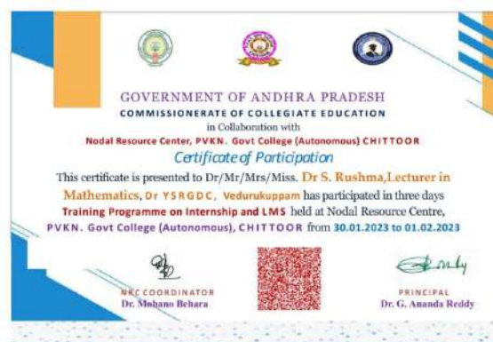
Fig: TOT Certificates.

The above are glimpses showing various awareness programs attended and participated in by the college teaching faculty in the month of January 2023