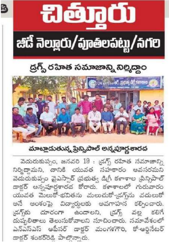
Fig: News clipping of Drug Abuse Awareness