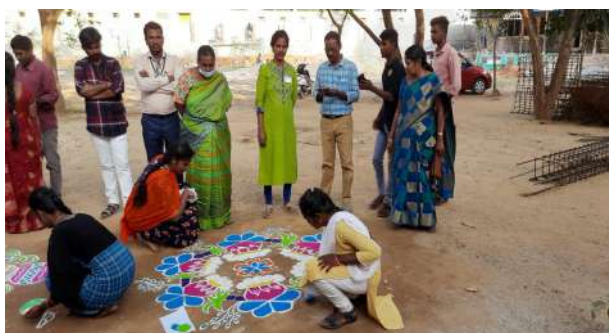
Fig: Glimpse of the Rangoli competitions