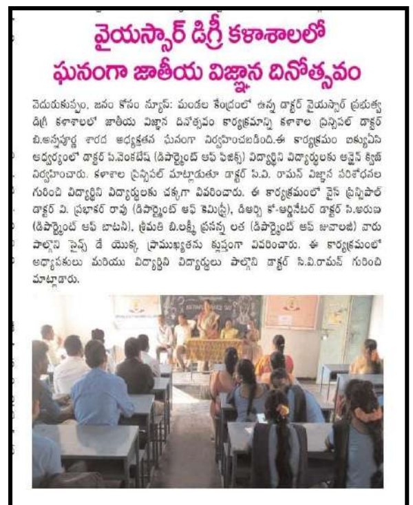
Fig. Newspaper clippings of the NSD- Program.