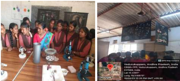
Fig: Science Faculty showing science lab experiments to students of GJCs on 15/2/23.

On the 16th the principals/in charge principals of chavatagunta, penumur and chadragiri were invited to the Open-Day program and were honoured to build a good rapport. The following are a few glimpses of the program.