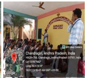
Fig: Canvassing about Open day at GJC, Chandragiri, TPT by Staff GDC, VKuppam.