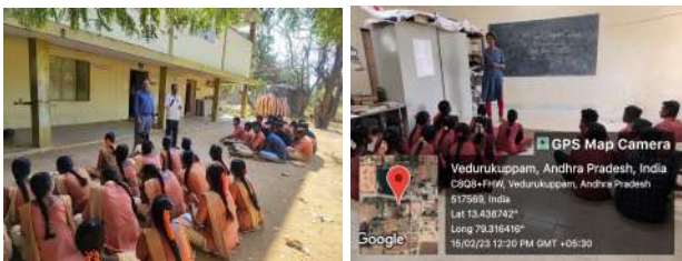
Fig: Canvassing about Open day at GJCs, Penumur & Vkuppam by the teaching staff of GDC, VKuppam.

On the 16th the principals/in charge principals of chavatagunta, penumur and chadragiri were invited to the Open-Day program and were honoured to build a good rapport. The following are a few glimpses of the program.