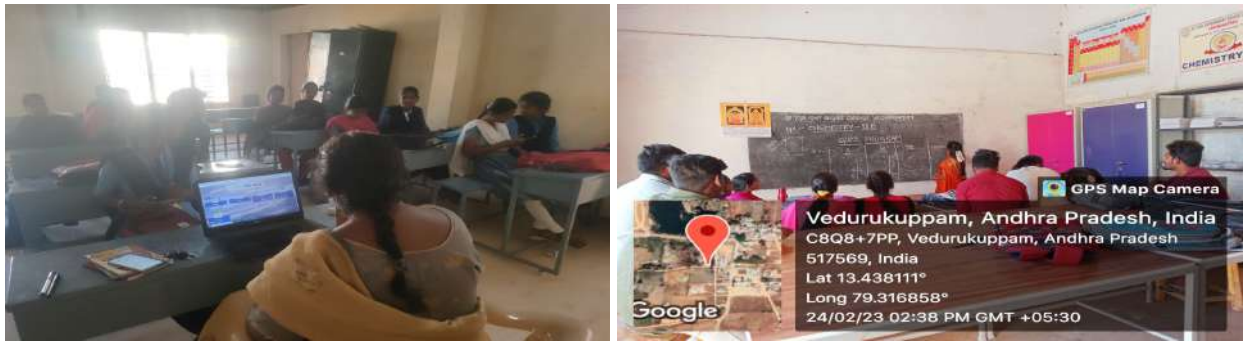
Fig: Online and offline teaching, Quest lectures, Quizzes, seminars, Mid exams conducted by Dr YSR Government Degree College Teaching Fraternity in the month of February 2023.