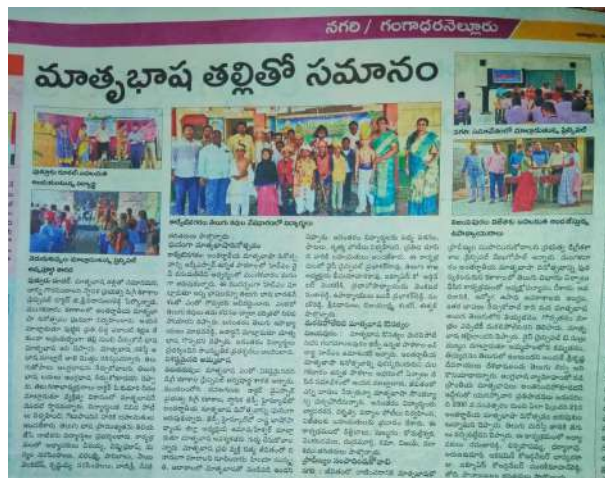
Fig: Newspaper clipping of the program.