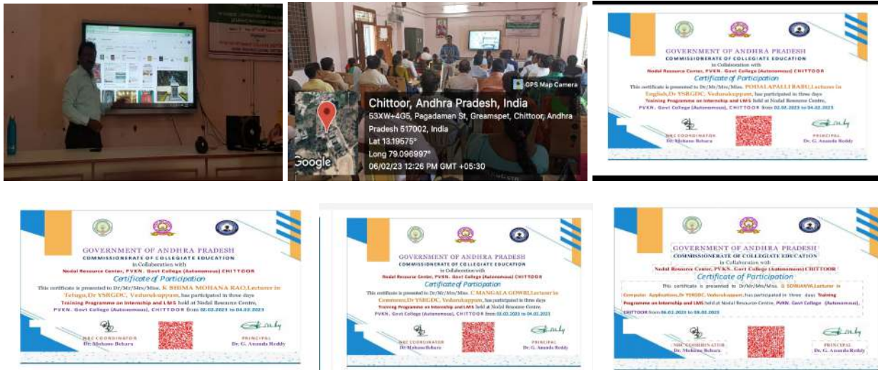
Fig: The above are glimpses showing TOT program attended and participated by the college teaching faculty in the month of February 2023 at PVKN (A) Degree College, Chittoor