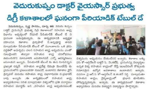
Fig. Newspaper clippings of the National Periodic Table Day Program. Department of Chemistry conducted the program under the umbrella of IQAC of Dr. YSR Government Degree College, Vedurukuppam, held on 7th Feb. 2023