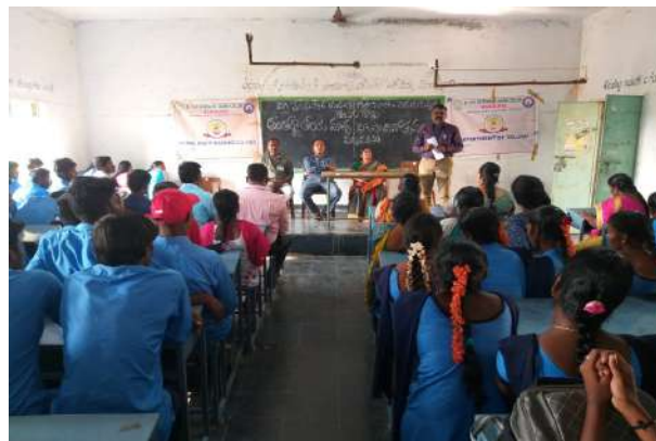
Fig: Speech by the HOD of the Telugu Department