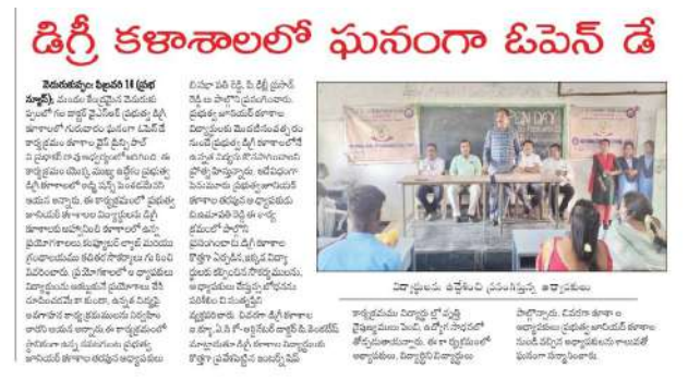
Fig. Newspaper clippings of the Open day