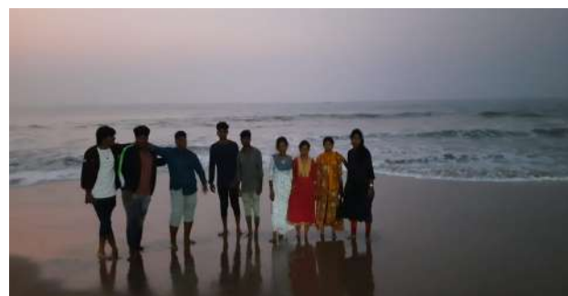
Fig: visit to the Sea Shore, Chennai Merine Beach