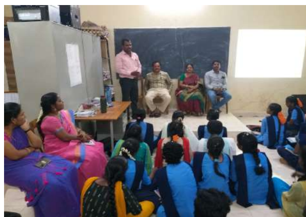
Fig: Speech by the coordinators of the CSP, Internship and LIP, apps proposed by APCHE ➤ Awareness program on I-MAP (27.04.2023) In Andhra Pradesh, several internship monitoring applications have been implemented to streamline the process, enhance transparency, and ensure effective supervision. These applications offer various features that facilitate the monitoring and evaluation of internships, benefiting both students and institutions.