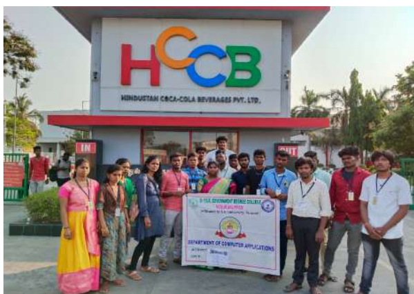
Fig.: As a part of the educational tour- Vigit to Coco Cola Beverages ( HCCB Company), Pundgamalli, Chennai,