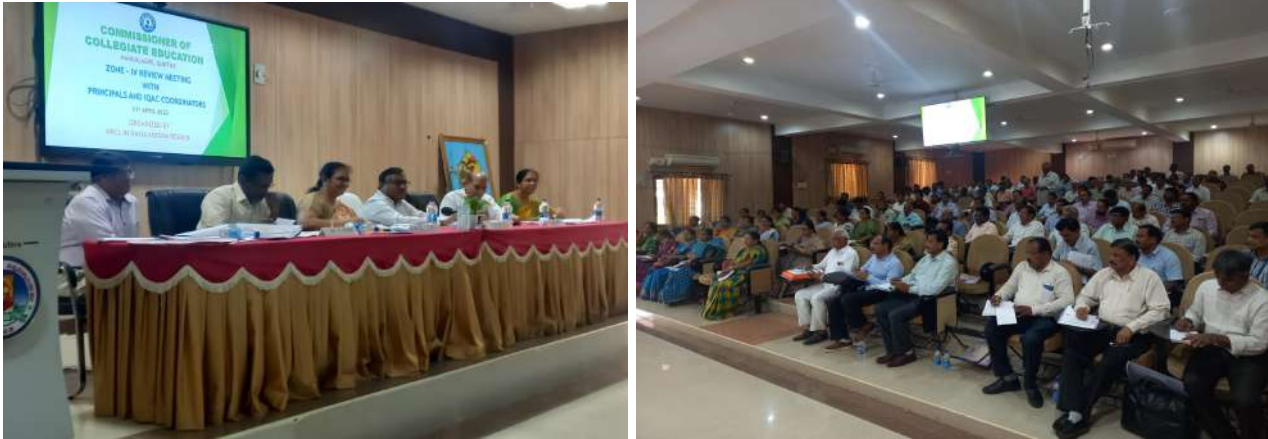
Fig.: A review meeting at SPMVV, Tirupati, for Zone-IV GDCs and PACs, is held on April 21st, 2023, with the principals and IQAC Coordinators by the Honourable Commissioner on the academic activities.