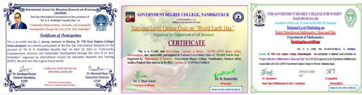
Fig: Online participation certificates of Dr YSR GDC, Vedurukuppam teaching staff.