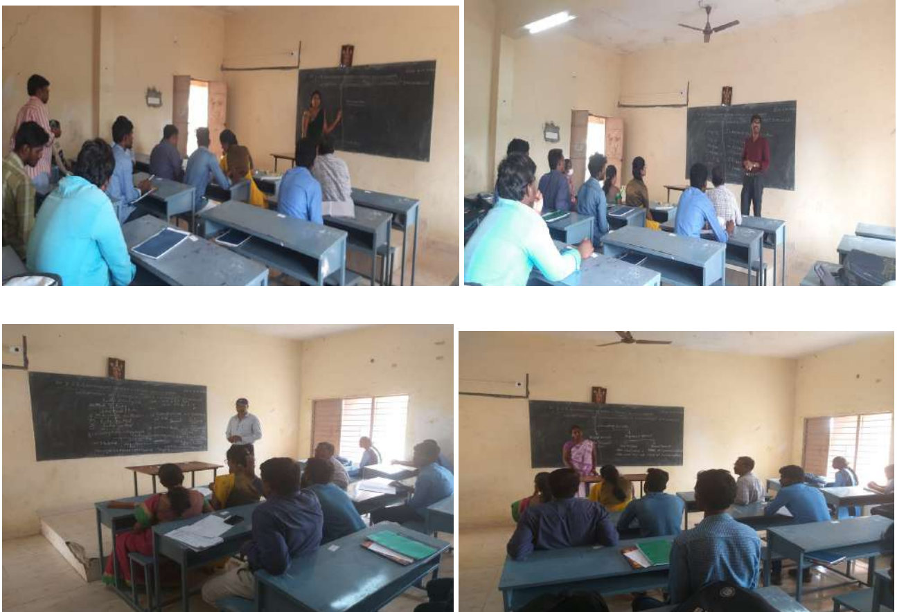
Fig: An interview for the selection of commerce quest faculty was held on April 4th, 2023