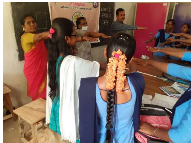
Fig:Oath taken by the students to protect Earth

celebrating World Earth Day in college provides an opportunity to educate students, engage the community, and inspire sustainable practices for a healthier and greener future.