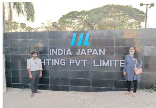
Fig: Visit to the lightning industry at Chennai

The Department of Commerce and the Department of Computer Applications together initiated an educational tour on April 19th, 2023, to provide students with a break from their regular routines and offer a unique opportunity to step outside their comfort zones to explore new things. They facilitate lifelong learning as they encourage students to continue learning beyond the classroom setting.