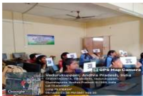
Fig: Pickers Quiz Conducted by department of botany to III BSc BZC students