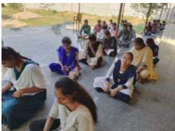
Fig: రెండవ మధ్యంత తలుగు పరీక్ష రాస్తున్న మొదటి మరియు రెండవ సంవత్సరం విద్యార్థిని విద్యార్థులు

From December 16, 2023, onwards, the College in Vedurukuppam diligently conducted its Mid-II Internal Examinations, marking a significant milestone in the academic calendar.