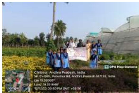
Fig: Botanical field excursion by the department of botany for 2nd BZC students.

These excursions served as a crucial evaluation point for students, allowing them to demonstrate their understanding and mastery of the subjects they have been studying.