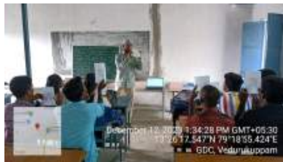
Fig: Pickers Quiz Conducted on Paper C1 and C2 Computer Science Concepts